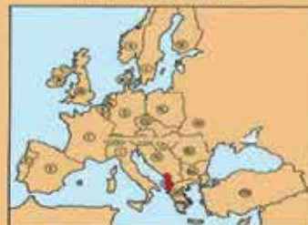
THE PLACE OF ALBANIA IN EUROPE